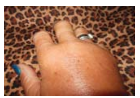
Yellowjacket stings caused swelling in this reporter's hand.